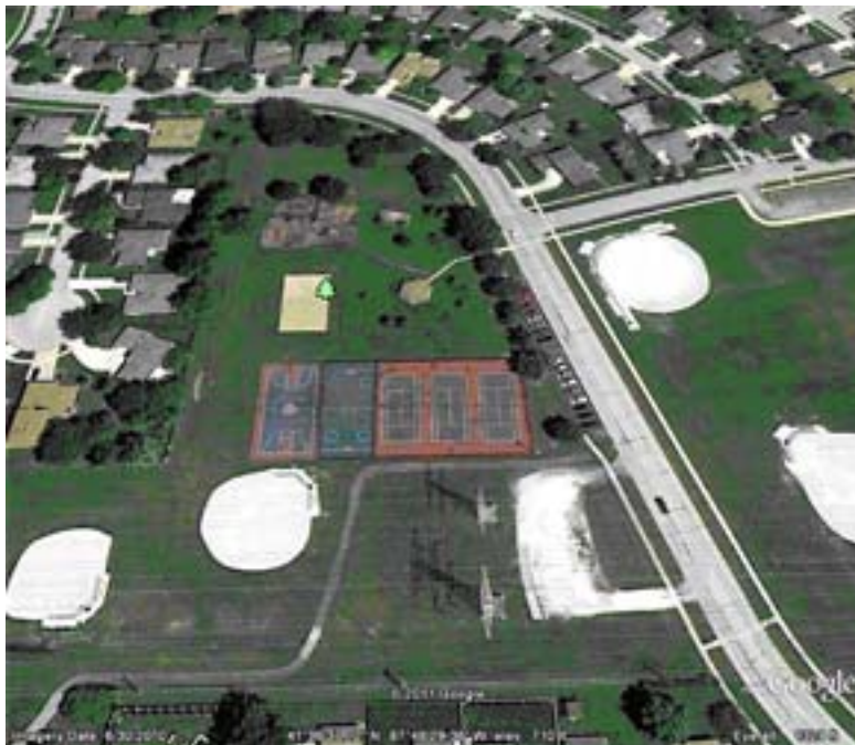
Veterans Park 4 Tennis Courts; 1 Inline Hockey; 1 Basketball Court