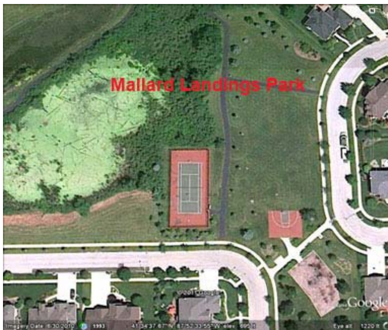
Mallard Landings Park 1 Tennis Court