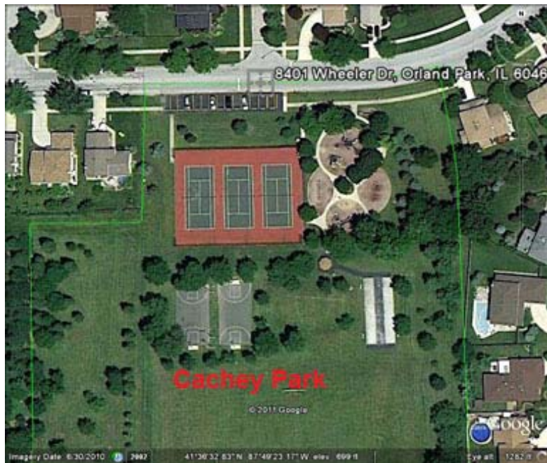
Cachey Park 3 Tennis Courts; 2 Basketball Court