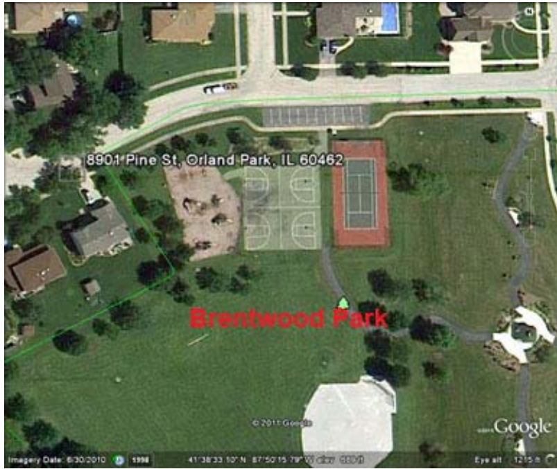
Brentwood Park 1 Tennis Court; 2 Basketball Courts