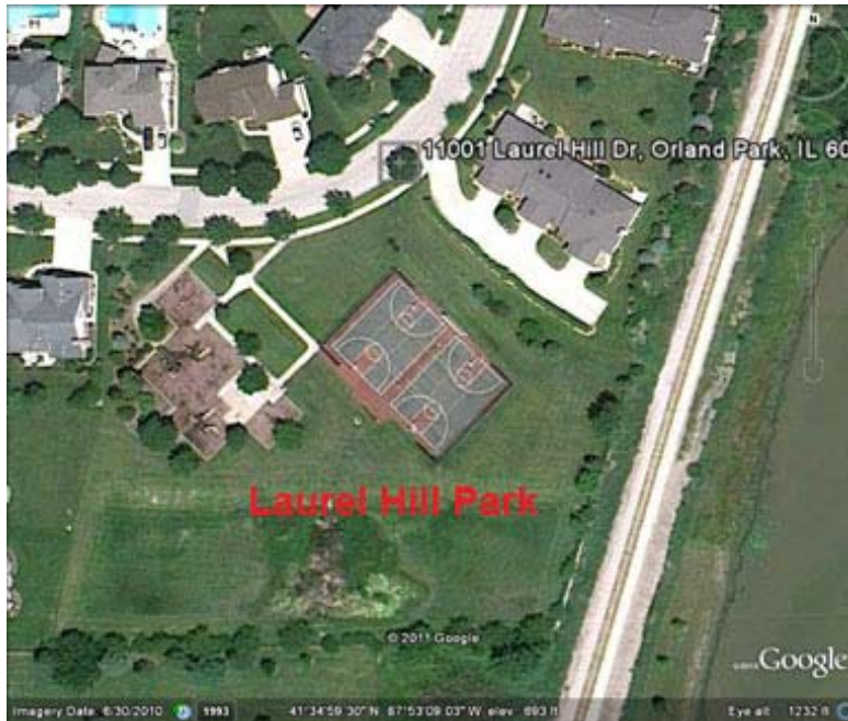
Laurel Hill Park 1 Tennis Court (with a multipurpose court within the tennis court)