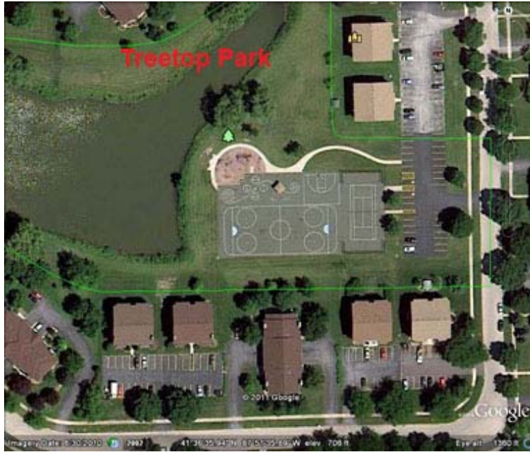
Treetop Park 1 Tennis Court; 1 Multipurpose Court