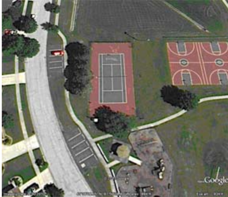
Heritage Park 1 Tennis Court (Basketball Courts excluded)